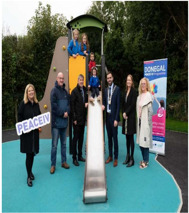
Killea Playground Opening