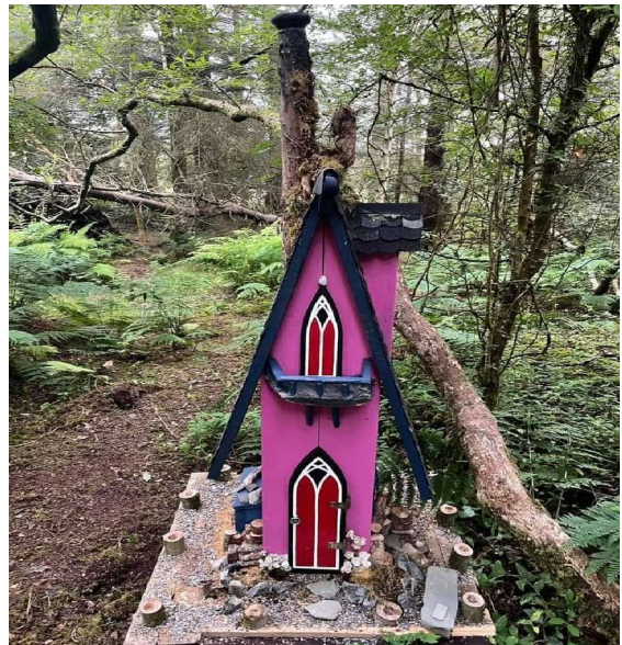
Dungloe River Walkway