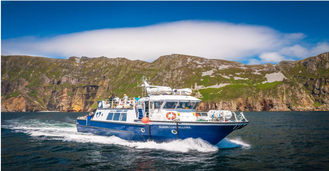
Atlantic Luxury Cruises

Donegal LCDC, in its role as the LAG approved the full allocation of both Transitional & EURI Programme funds by the end of December 2022 with a total of 62 projects being approved, 13 of which were approved under the EURI Programme.