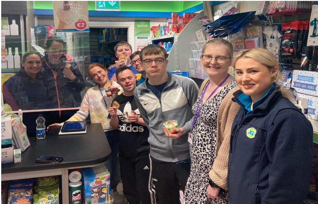
SICAP –Participants in the Fit2Work Employment Support Programme with Bluestacks Special Needs Foundation