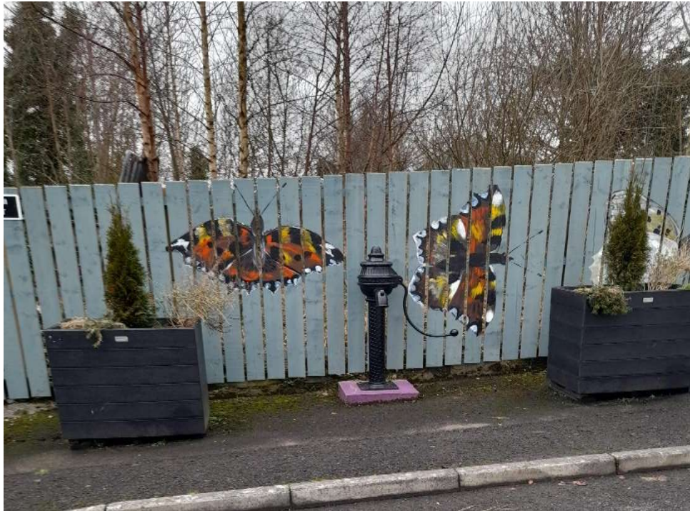
Carrigans Tidy Towns – Works funded through Community Activities Programme