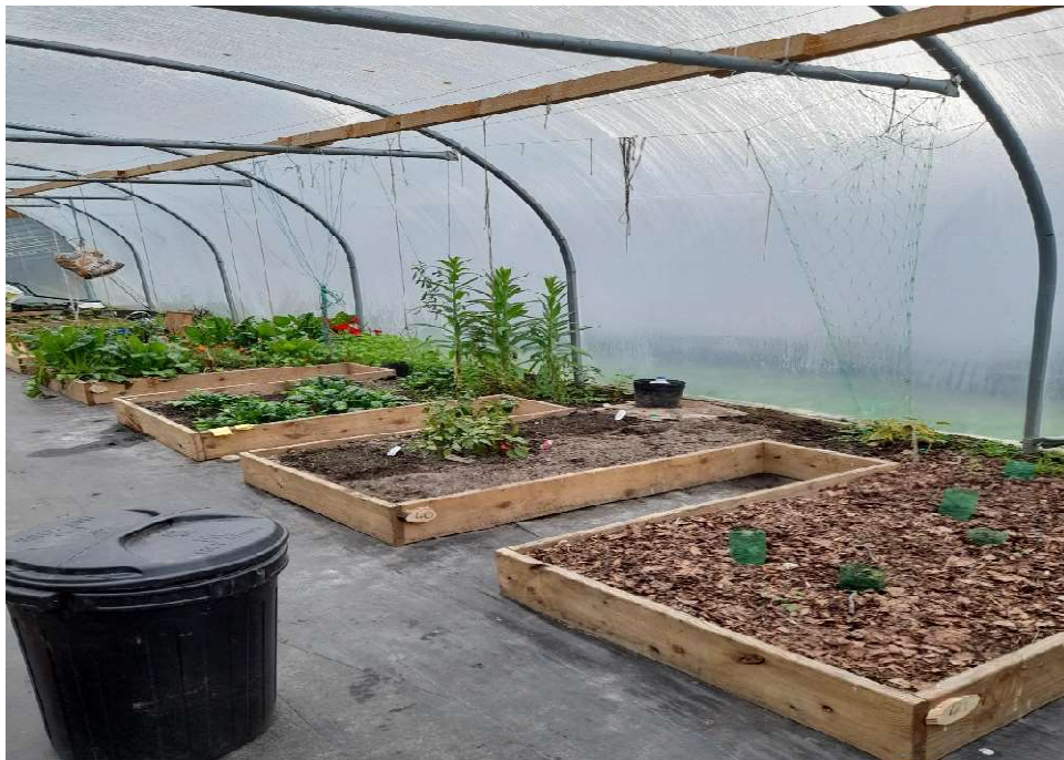
Letterkenny Community Garden – funded through Community Activities Programme

42% percent of the funding was awarded as 225 small grants of €500-€1,000 with the balance being awarded as 25 large grants of €5,000 - €10,000 to Community Groups throughout the County.