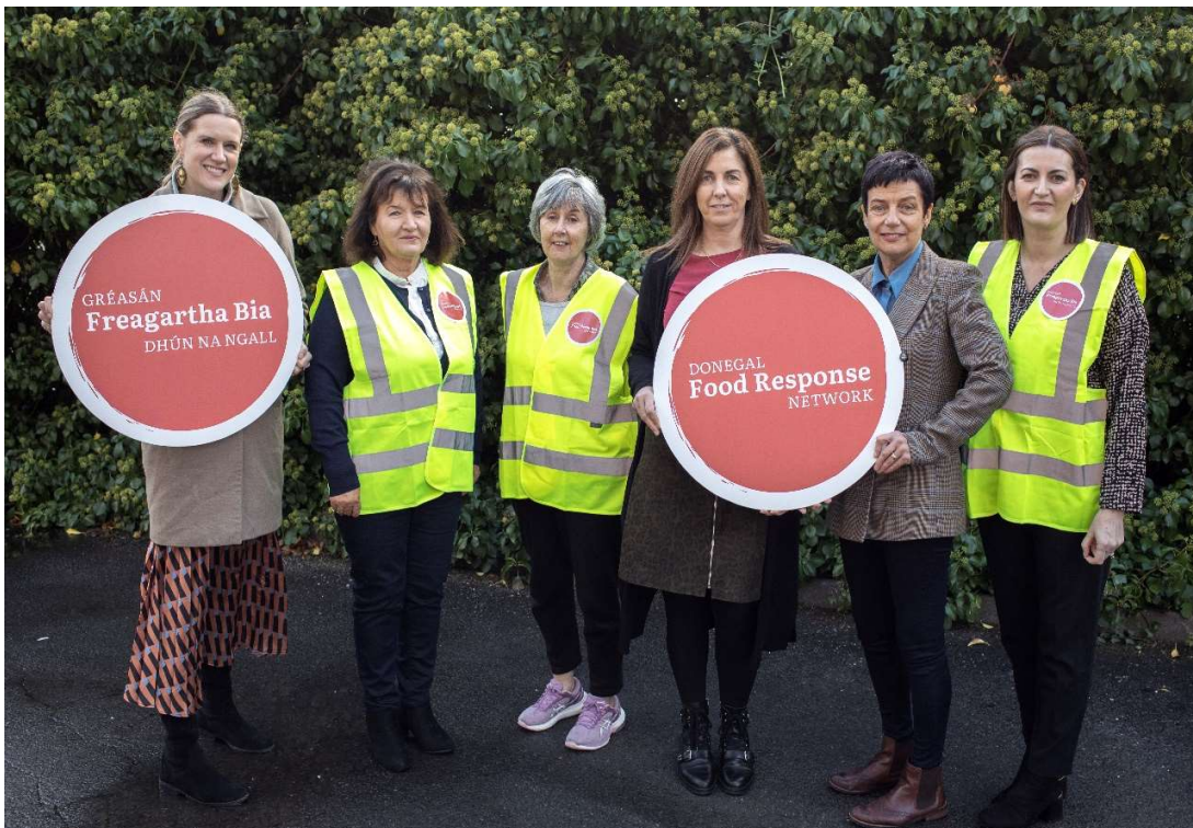
Donegal Food Response Network – supported by SICAP Programme